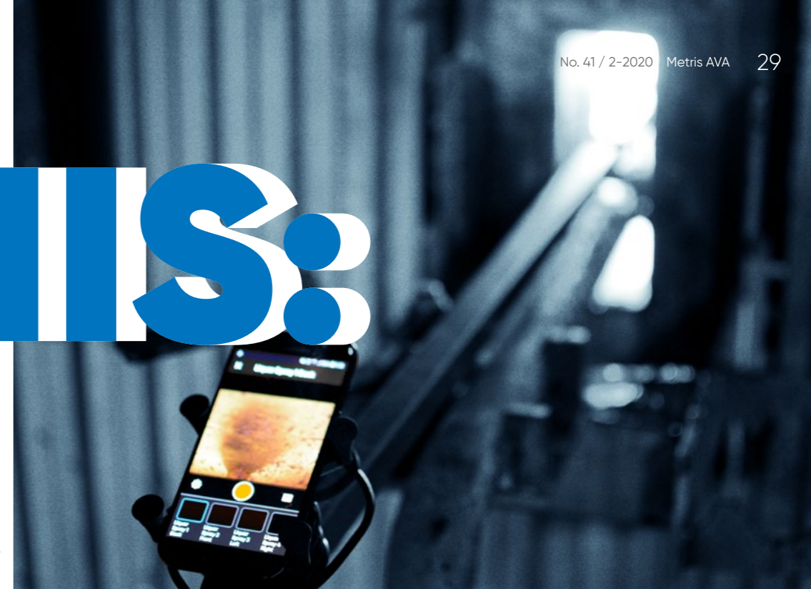
Recovery boiler sample taken with Metris AVA