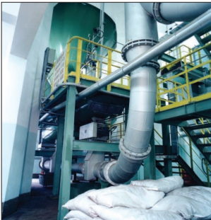
A regeneration plant for treating used pickling acids

Regenerative burners in continuous annealing furnaces for stainless steel strip provide energy savings of 10% to 20% over the central recuperator system. At the same time, the lowest NOx values are achieved.