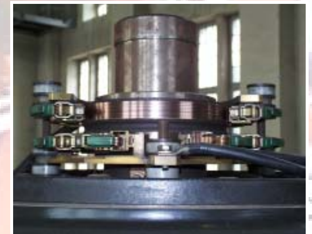
Slip-rings for transfer of excitation power