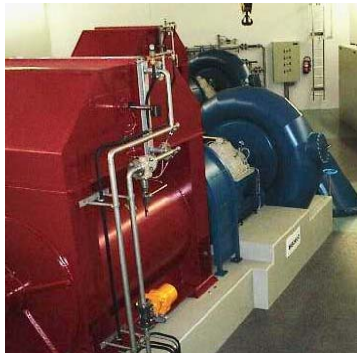
Generator with turbine