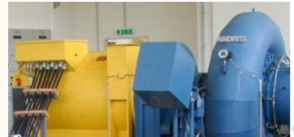
Generator with turbine

We have latest state-of-the-art tools for configuring, programming, operation and maintenance. These tools permit easy handling, as well as providing rapid diagnostic and monitoring functions for maintenance and service assignments. These tools are available for local and remote access.