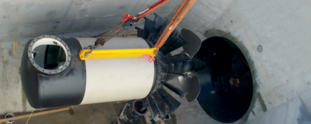
s ECOBulb™ lifting into powerhouse

ANDRITZ HYDRO has sold 12 units featuring the classic generators and 30 ECOBulbs™, with runner diameters between 1,950 mm and 3,650 mm and outputs between 1 MW and 8 MW.