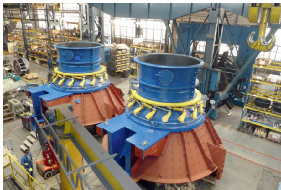
t Compact Axial Bulb turbines for HPP Lixhe during workshop assembly

All of the above mentioned examples of recent projects covering the extension of the range of COMPACT HYDRO in terms of technology, scope, and size and demonstrate the versatility of the business unit in adapting its structure and strategies to the effective needs of the markets and its customers. ANDRITZ HYDRO never rests on past success.