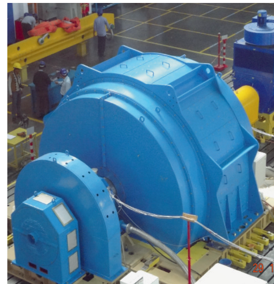
† Generator for HPP Forrest Kerr on the test bench at ANDRITZ HYDRO India

Over the last few years the Compact Axial Bulb Turbine has become a success story in the low head market for CH. The new turbine type is available in two different direct-drive generator designs, salient poles synchronous or permanent magnet (under the brand name ECOBulb™). In the recent years,