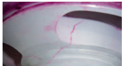
On site service