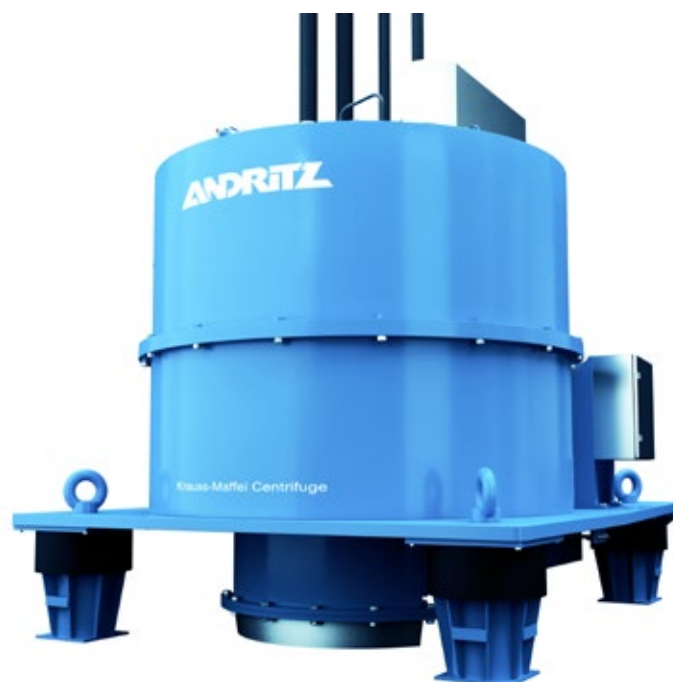
Krauss-Maffei gypsum centrifuge VZU-G