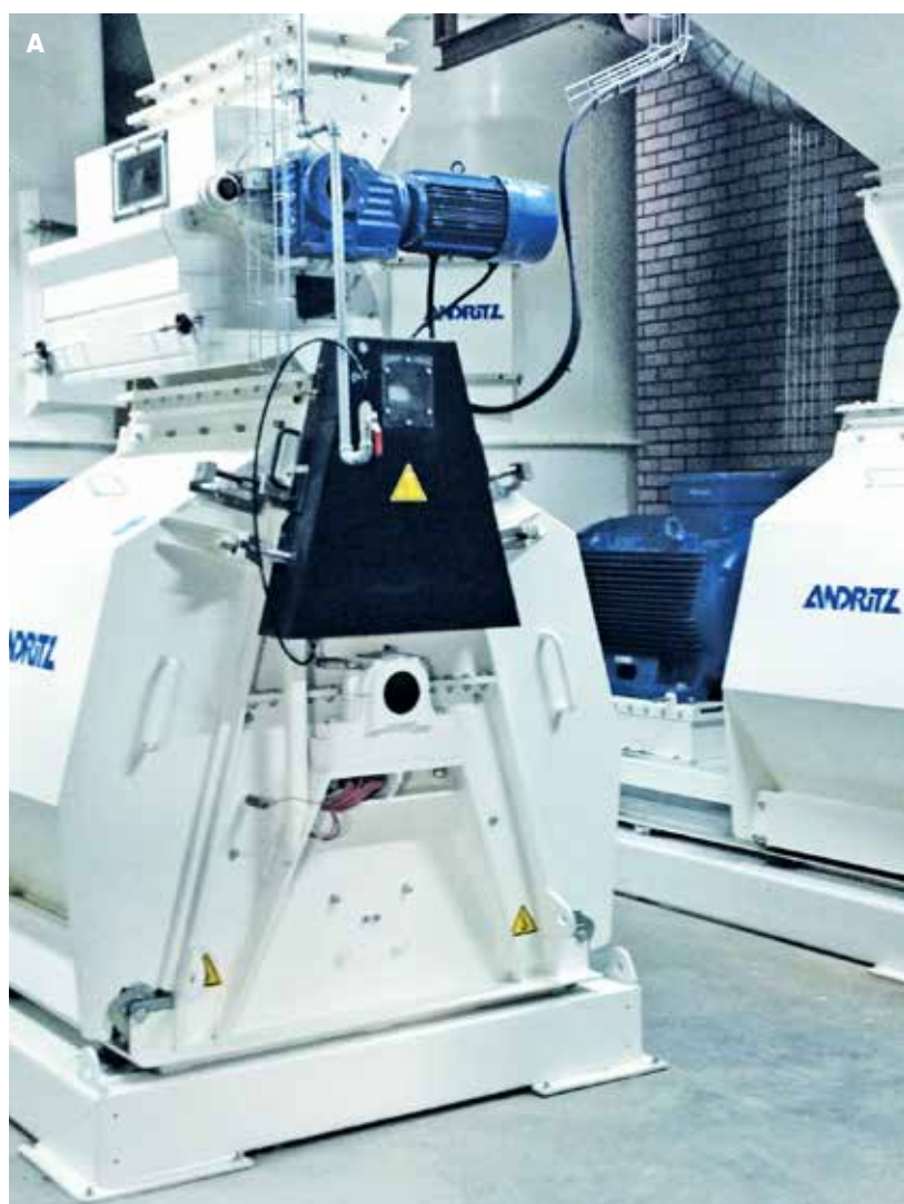
A The Optimill consists of a hammer mill for raw material grinding of normal to coarse structured feed products, such as cattle, pig and poultry feeds.

data logging system ensures full process and product traceability, and the automation equipment includes preventive maintenance systems.