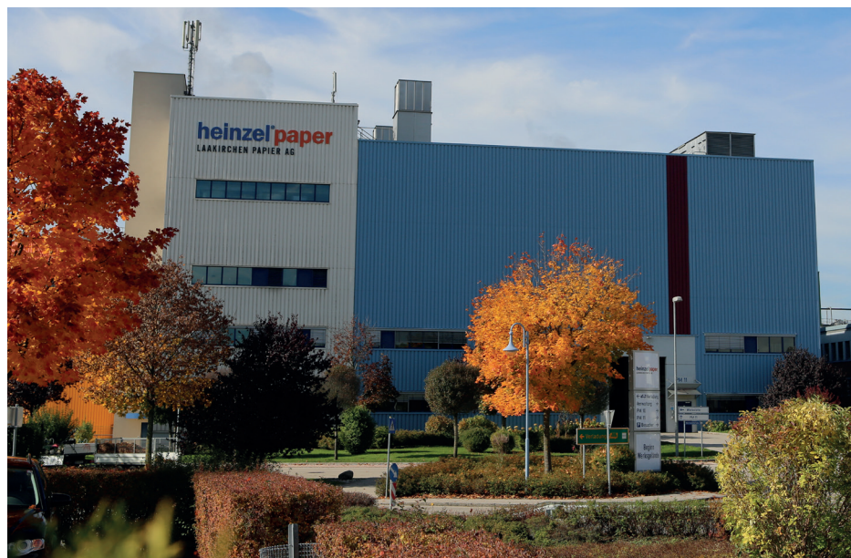
▲ Laakirchen Papier AG

For more information about ANDRITZ's services and to talk to a service partner, please visit www.andritz.com for details.