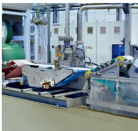
▲ ANDRITZ Küsters technical center in Krefeld

The Elbeuf technical center welcomes customers for demonstrations, trials, and product developments, with the most advanced crosslaid technology. The pilot line is configured with full size industrial machines combining opening and blending, an eXcelle double card including the TT concept, a Dynamic crosslapper, two fabric web drafting units and needle-looms, followed by a semi-automatic winder. A velour structuring machine is also available off-line.