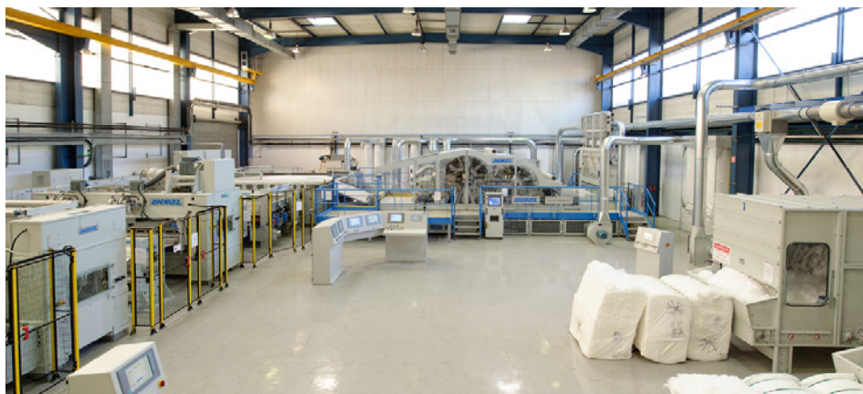
▲ ANDRITZ Asselin-Thibeau technical center in Elbeuf

as your partners in product development. Evaluation of new processes and definition of parameters for product guarantees are another main focus.