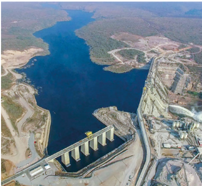
View of powerhouse, dam and area

ANGOLA – Angola has one of the fastest growing economies in the world. Due to rapid urbanization and population growth, especially in the capital city of Luanda, there is a huge and growing demand for electricity. As a result Angola has taken steps to improve its energy supply.