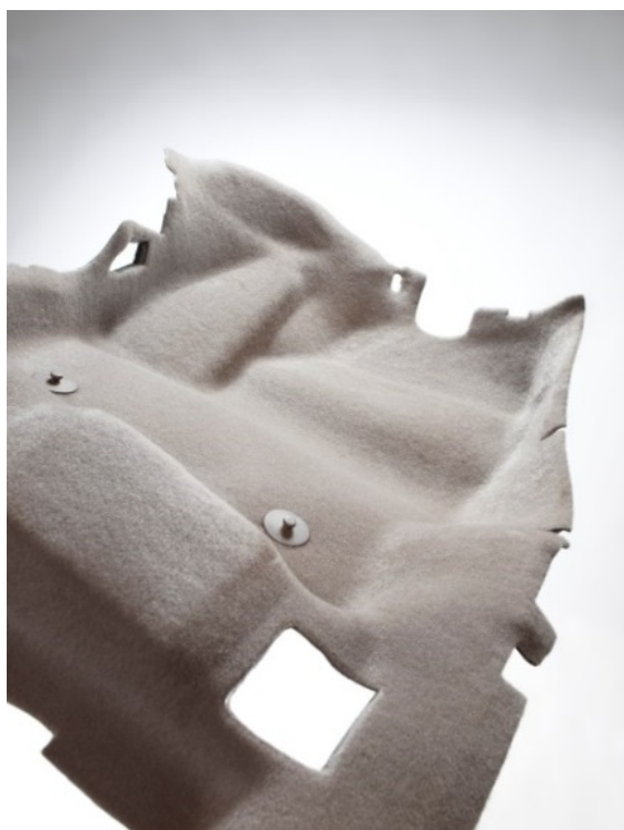
Autoneum's Di-Light based nonwoven carpet.