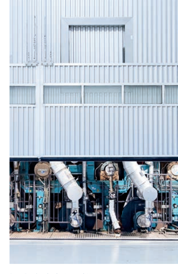
PrimeDry Steel cylinders yield better drying performance with the same size and operating pressure as traditional cast-iron cylinders, and thus help to increase production or save energy.

October 28, 2017 saw production of the first roll of corrugated base paper at Heinzel Group's Laakirchen Papier AG in Austria. ANDRITZ took on the challenge of the remarkable conversion of the mill's PM 10 from graphic paper to packaging paper, including a rebuild of the groundwood mill into a complete OCC line. The rebuilt machine is now performing well over the planned start-up curve, ready to capture a fast-growing market.