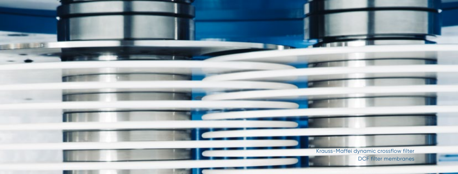
Krauss-Maffei dynamic crossflow filter DCF filter membranes