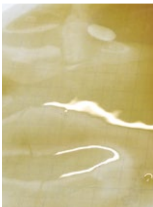
Purified oil after dynamic crossflow filtration

In traditional crossflow filtration, a clogging layer is prevented from developing on the surface of the filter membranes by pumping the feed. However, this method is neither efficient nor viable when handling sensitive or highly viscous products. At ANDRITZ Separation, we have taken a leap forward in development and designed the Krauss-Maffei dynamic crossflow filter DCF. In this process, overlapping rotating disks generate a differential speed. This setup creates a crossflow without requiring a pump to circulate the slurry and without any circulation line at all. The stationary principle of crossflow causes a zone of discontinuity at the entrance to the overlapping zone. This zone of discontinuity creates a very efficient, local cleaning effect due to the turbulent flow. The turbulent flow is directed in parallel, but also perpendicular to the membrane surface. The perpendicular component in particular generates high detaching forces, even in highly adhesive clogging layers.