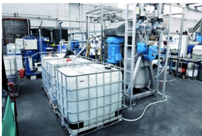
Krauss-Maffei dynamic crossflow filter DCF installation in an oil purification application