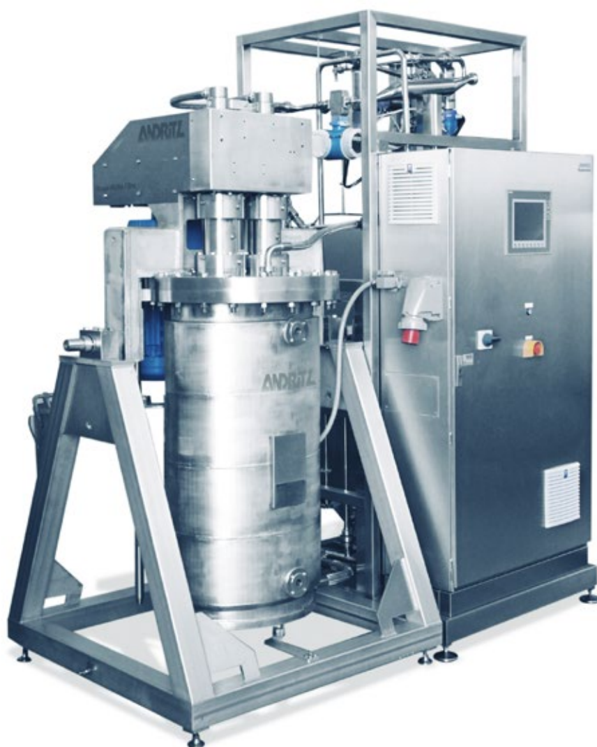
Krauss-Maffei dynamic crossflow filter DCF skid