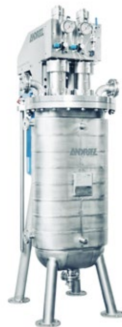
Krauss-Maffei dynamic crossflow filter DCF