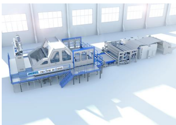
ANDRITZ neXline spunlace aXcess.