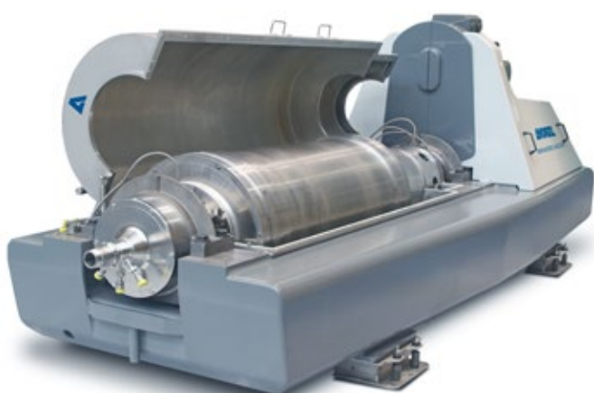
Decanter centrifuge F7000 for removal of liquid phase from fruit

To complete the first separation phase performed with a decanter, ANDRITZ specialists recommend a second separation phase with a separator to ensure finest clarification of your vegetable milk. ANDRITZ high-speed clarifiers are the right solution to separate the finest solids and ensure a higher clarification rate. The second separation stage guarantees excellent removal of the suspended solids, giving your vegetable drinks a smoother and more pleasant texture.