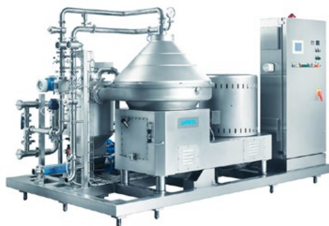
ANDRITZ separator CA131V for fine clarification