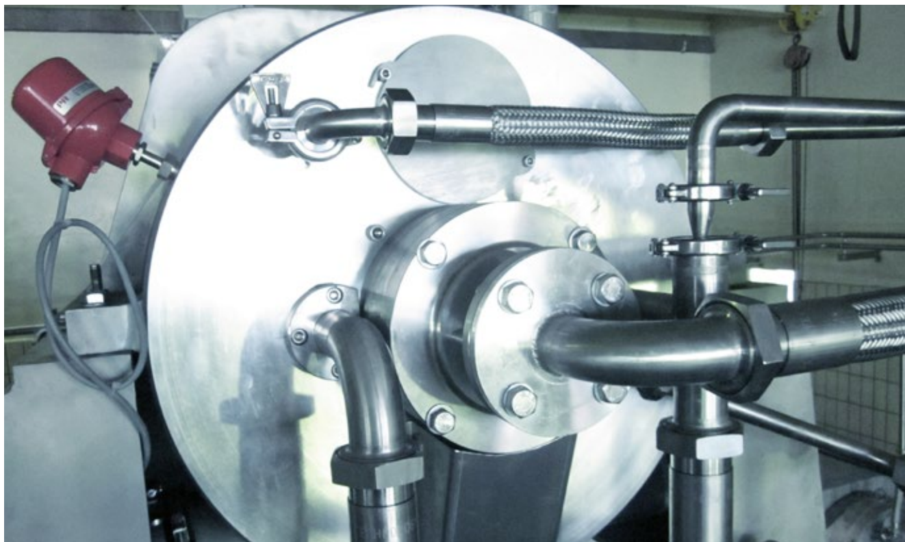
Centripetal pump with special discharge system that reduces foaming