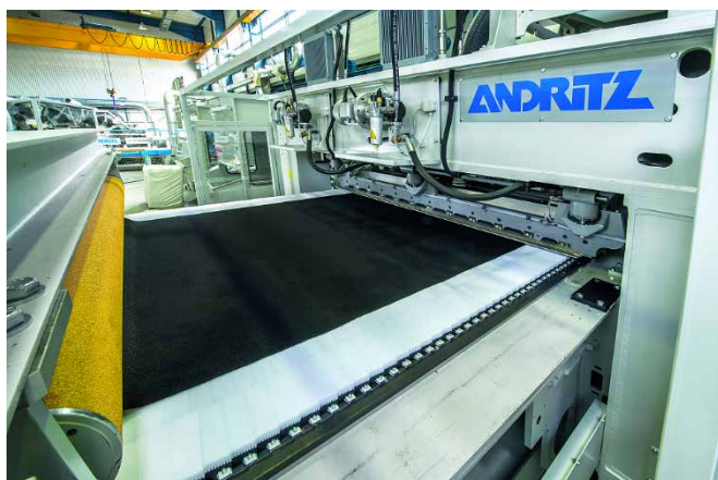
ANDRITZ velours needleloom for automotive products.