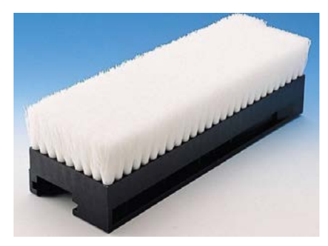
Patented ANDRITZ brush