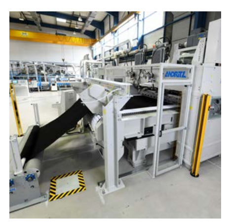
ANDRITZ SDV velour needleloom