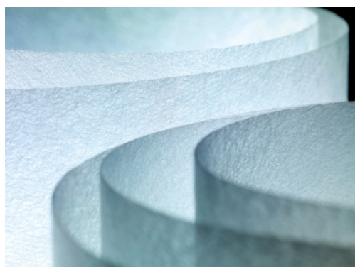
Saint-Gobain Adfors glass fiber mats.