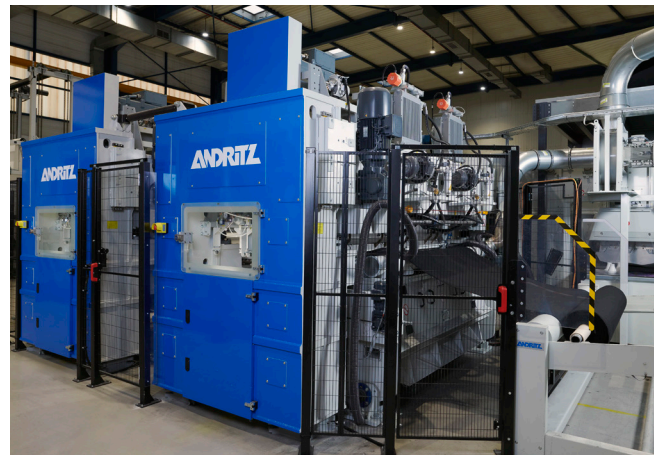
neXloom specialties Velour Type SDV2+2 needleloom

Test your new developments on our state-of-the-art needlepunch line. It is the perfect opportunity to experience new products that will enable you to access different markets.