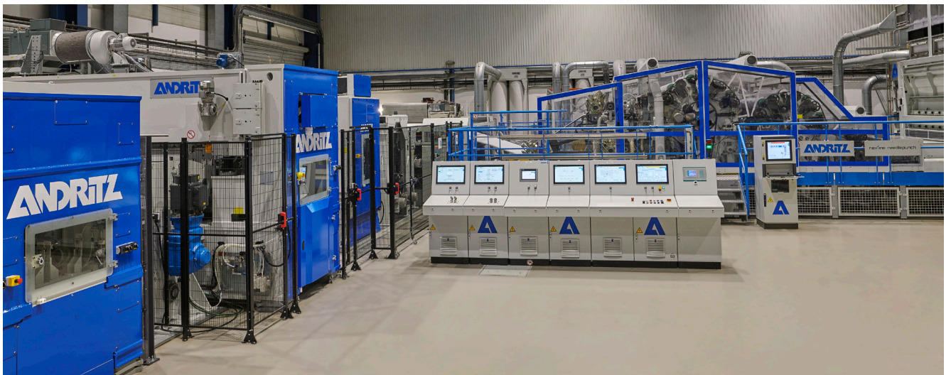
Needlepunch pilot line at technical center in Elbeuf, France

Seize the opportunity to join our product and process training sessions. Our experienced staff provide the best and unique know-how drawn from our installed base and continuous R&D. Learn how fibers become fabrics, develop your own products, and find out the latest news on needlepunch processes.