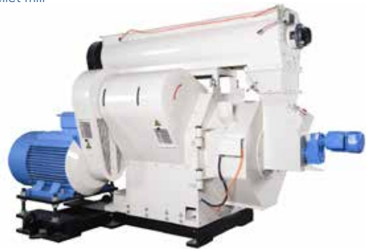
SVP53 pellet mill