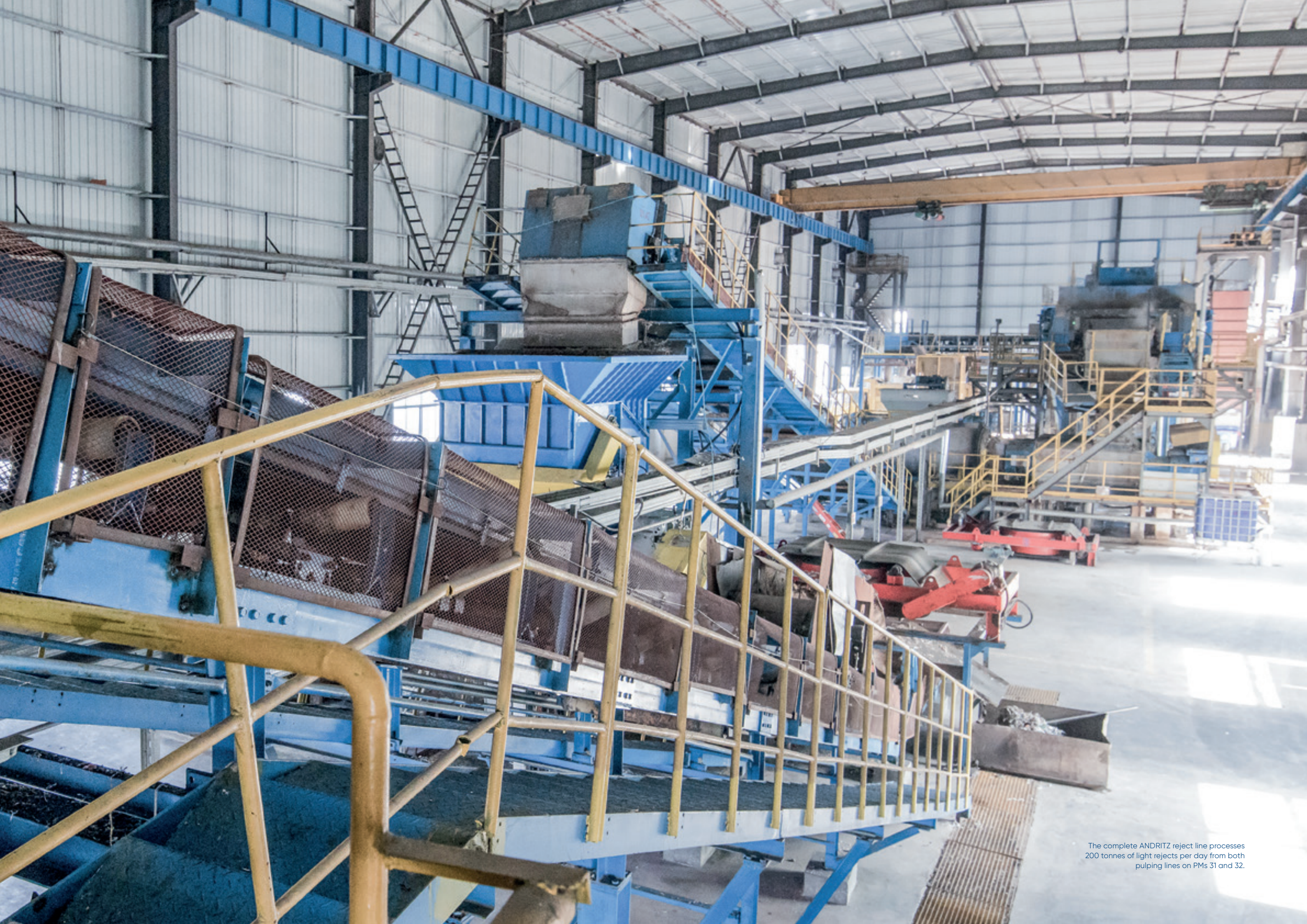
The complete ANDRITZ reject line processes 200 tonnes of light rejects per day from both pulping lines on PMs 31 and 32.