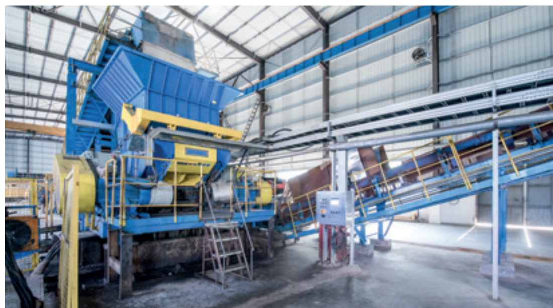
ANDRITZ Universal Shredder FRX