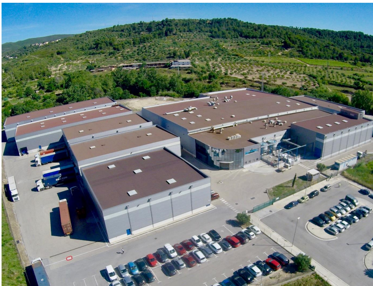
BCNonwovens facilities in Sant Quintí de Mediona, Spain