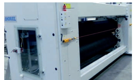
Pre-cylinder tacker for batt pre-consolidation

The ANDRITZ Asselin-Thibeau technologies are at customers' disposal for trials at the needle-punch technical center in Elbeuf, France.