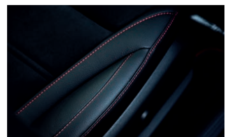
Premium quality for automotive markets