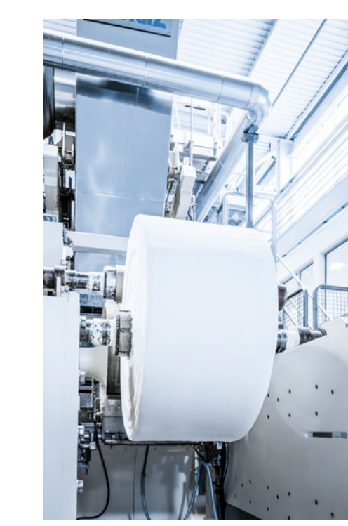
at the ANDRITZ pilot plant!

The PrimeLineVRT machine has been designed specifically to address the energy consumption of dry-crepe technology. Some 95% of global tissue production volume is produced using dry-crepe technology. The VRT