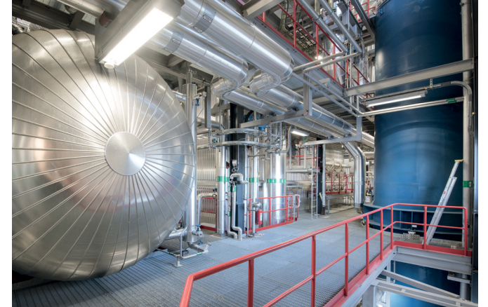
▲ The feedwater tank in the ANDRITZ BFB boiler.

came clear to us that a high priority for Karlstads Energi was to increase the electricity-to-heat ratio from the plant to be able to produce as much electricity as possible at a given district heat demand. For this, we worked with them to develop a tailor-made solution to boost the electrical output without increasing the steam parameters in the plant."