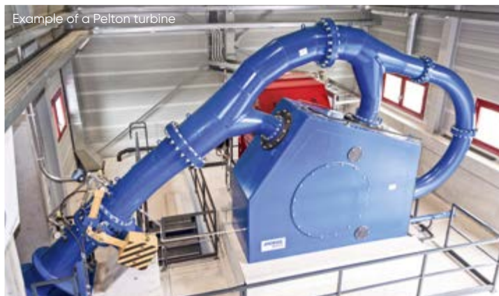
Example of a Pelton turbine

Total output: 3 × 6.1 MW Head: 257 m Speed: 428.6 rpm Runner diameter: 1,480 mm