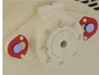
Shear pin retainer clip design