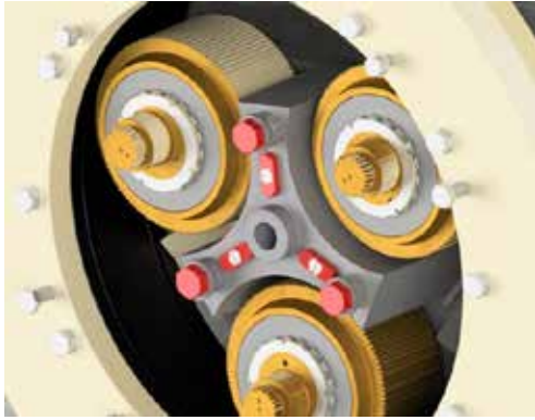
Improved roll holding plate support