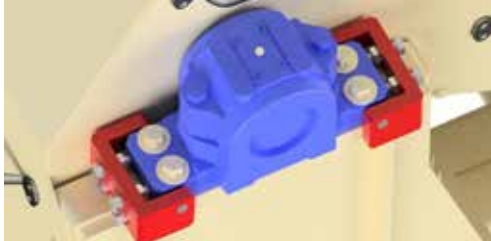
New bearing adjustment