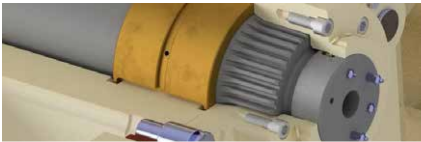
Larger shaft diameter with splines