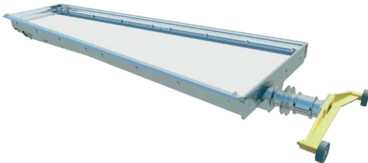
ANDRITZ cell vessel for tilting pan filter