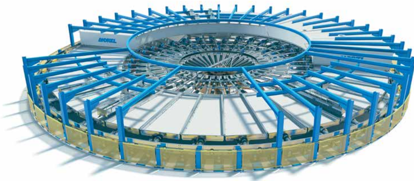
ANDRITZ tilting pan filter, a highly customizable system for phosphoric acid extraction