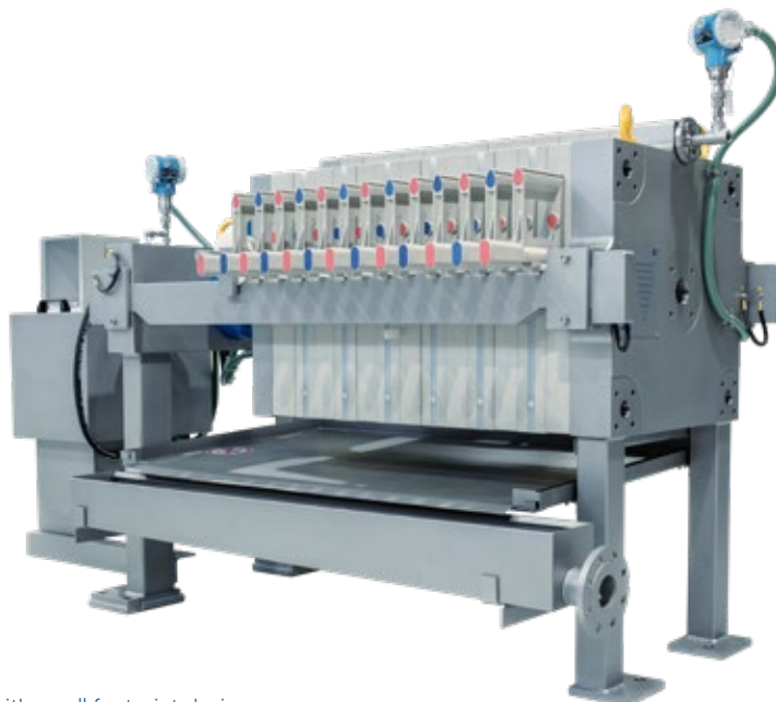
ANDRITZ sidebar filter press with small footprint design