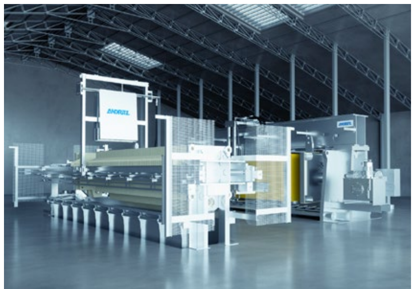
ANDRITZ sidebar filter press with steel/stainless steel design for a hygienic process