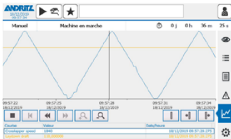
Carriage position graph