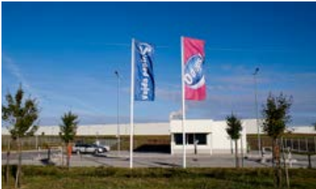
The mill at Dunaföldvár

Vajda Papír is one of Europe's most dynamically expanding tissue producers. The 100% Hungarian-owned private company operates tissue production mills in Hungary and Norway and covers a wide tissue product range. During its history covering almost two decades, the company has also won several regional and national awards for its business and product quality and focuses strongly on environmentally friendly tissue production.