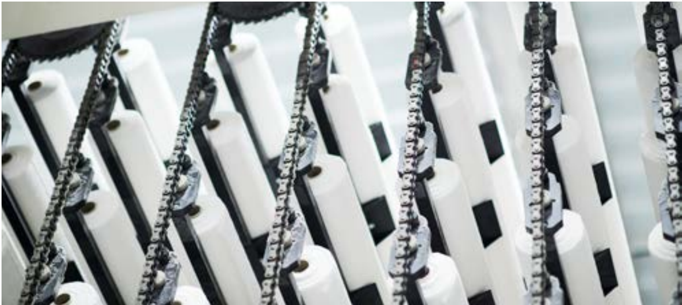
Vajda Papír started as a converting company about twenty years ago.

The 100% Hungarian-owned private company operates tissue production mills in Hungary and Norway and covers a wide tissue product range.