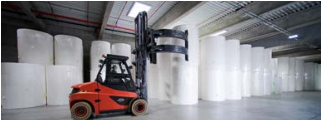
Full storage of high-quality tissue at Vajda Papír.

In June, the major new 1.8 billion HUF investment project was approved in order to increase the production capacity of Vajda Papír and invest in greenfield project for tissue production. The new mill covers 23,000 m 2 and has been erected on an area of 81,000 m 2 at Dunaföldvár.