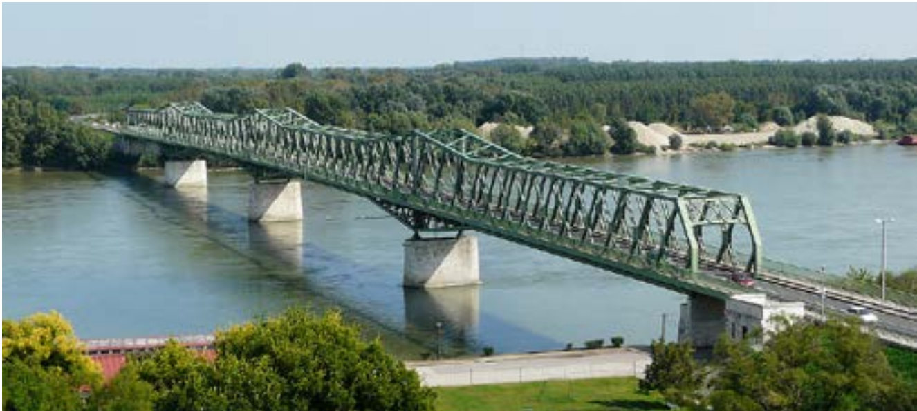
József Beszédes Bridge in Dunaföldvár

Dunaföldvár is located in Tolna County in Central Hungary, on the west bank of the River Danube.