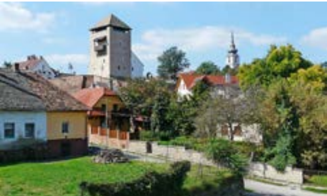
The Turkish tower (Csonka-torony), © Vadas Róbert