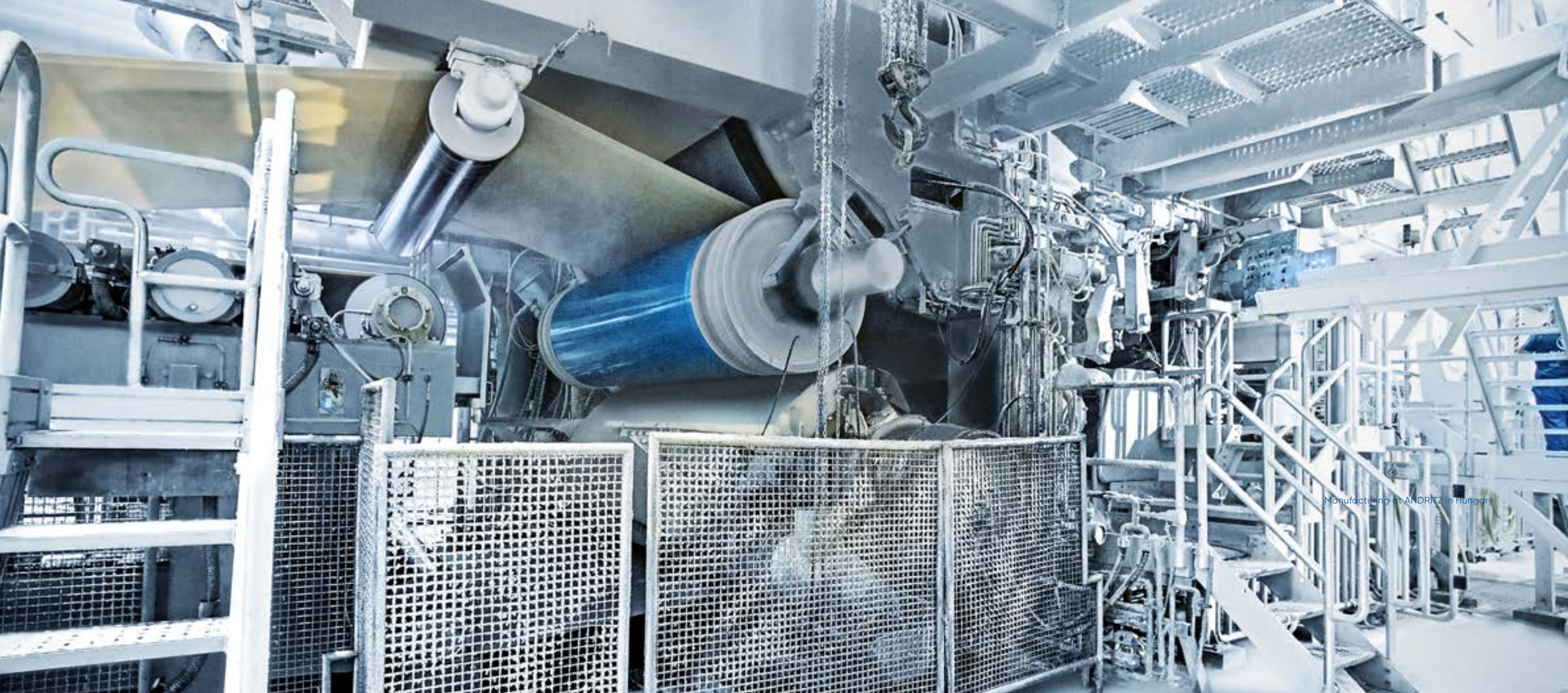
Manufacturing at ANDRITZ in Hungary