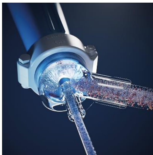
ANDRITZ Multi Injection Chamber (MIC)