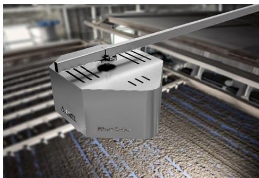
Metris addIQ RheoScan – optical measuring system for automatic polymer dosing