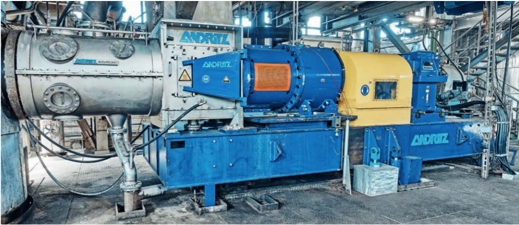
Adjustable Plug Screw Feeder