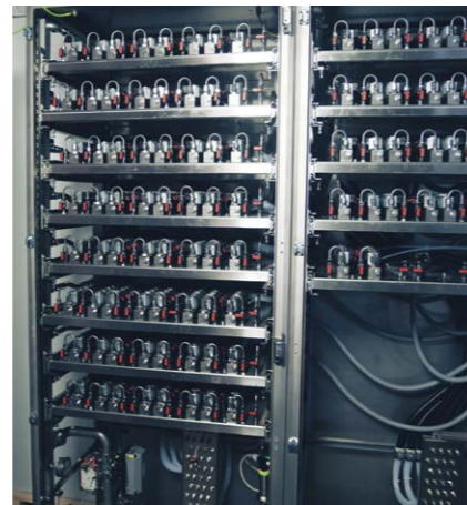
VIB valve control cabinet