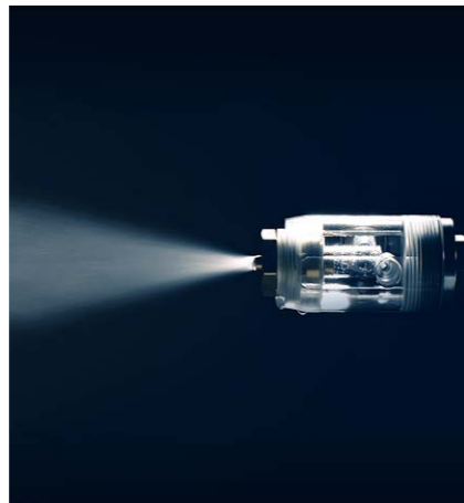
VIB spray nozzle