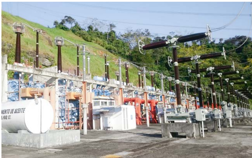
Malpaso main transformers