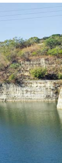
Angostura underground powerhouse

"This modernization project of all nine important hydropower plants represents one of the largest rehabilitation orders on the global hydropower market."