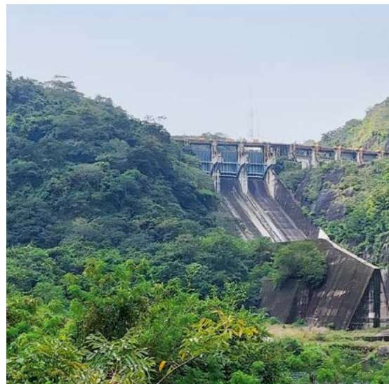
Malpaso dam and spillway

"The objective of the modernization is not only to increase the reliability of the power plants, but also to increase the operational life by 50 more years."