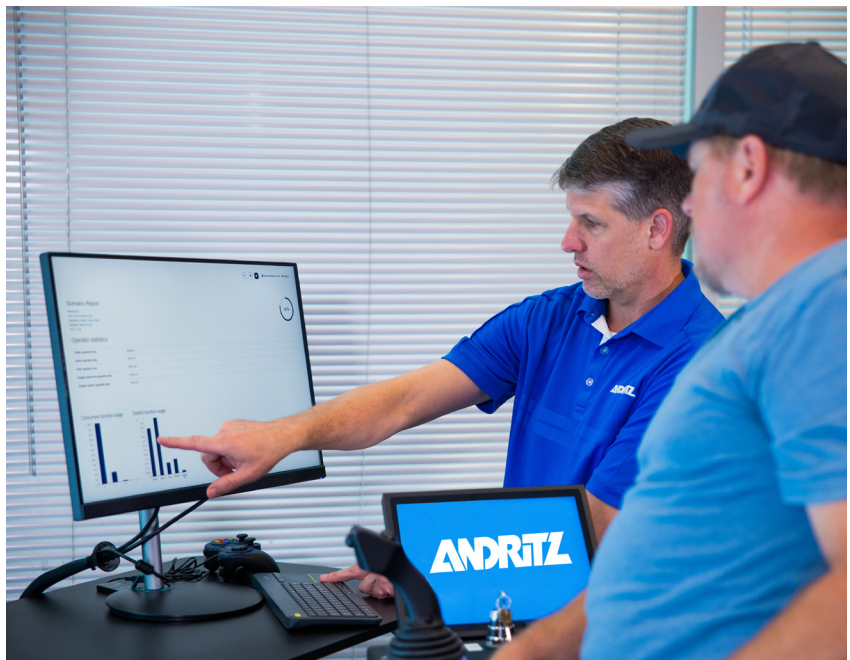
Attendees receive immediate feedback on various aspects of their performance