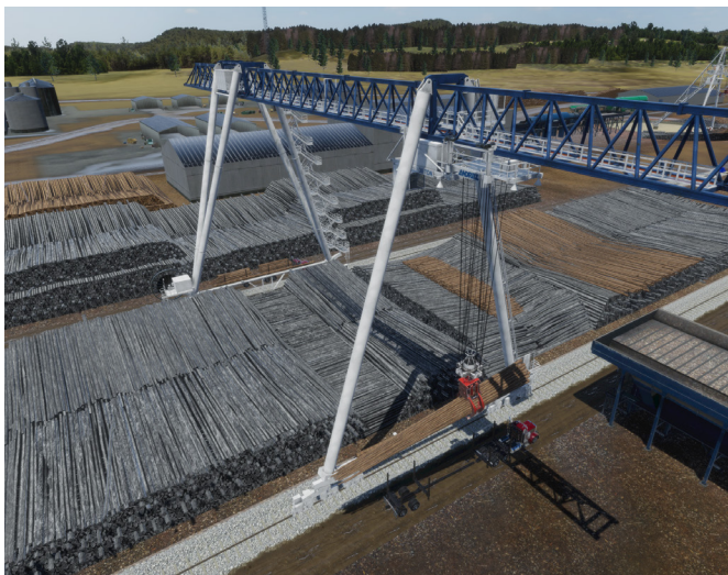
Linear crane unloading scenario