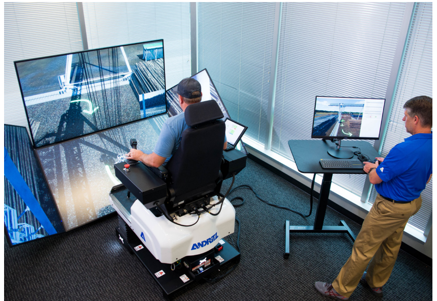
Hands-on instruction led by the dedicated ANDRITZ training team