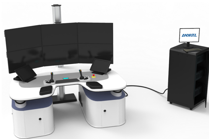
Remote desk simulator