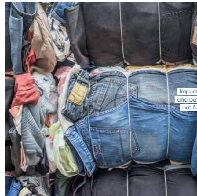
Impurities like zippers and buttons are sorted out from garments.

Infinite Fiber Company and ANDRITZ signed a cooperation agreement in 2020 to develop the process and equipment solutions for Infinite Fiber Company's textile fiber regeneration technology. Under the cooperation agreement, the two companies will work together to develop the factory process and equipment solutions, aiming to optimize every process step in