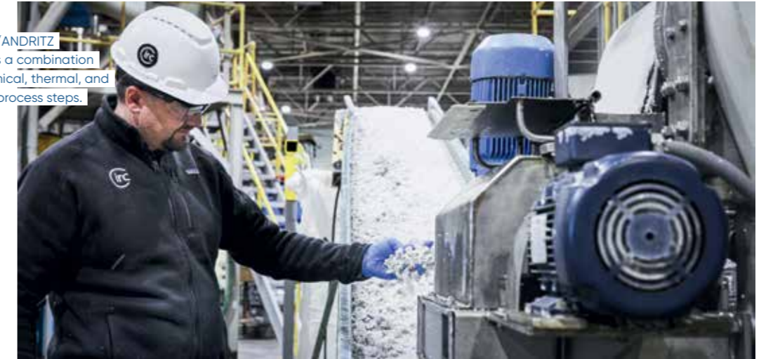
The CIRC/ANDRITZ concept is a combination of mechanical, thermal, and chemical process steps.

Laroche offers a different mechanical conditioning process based on tearing. With more than 2,000 reference projects worldwide offering one of the largest installed bases for textile recycling mills, ANDRITZ Laroche's mechanical recycling process can be preparatory to the following main options: nonwovens production lines, short staple fiber spinning mills for yarn "respinning" with the creation of woven or knitted fabrics, including