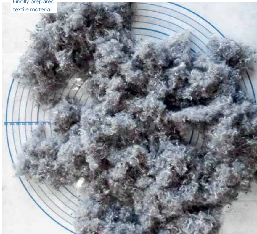
Finally prepared textile material

processes such as washing, mixing, cooking, bleaching, and drying.