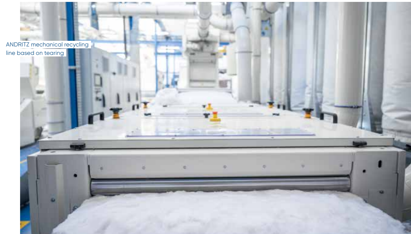
ANDRITZ mechanical recycling line based on tearing