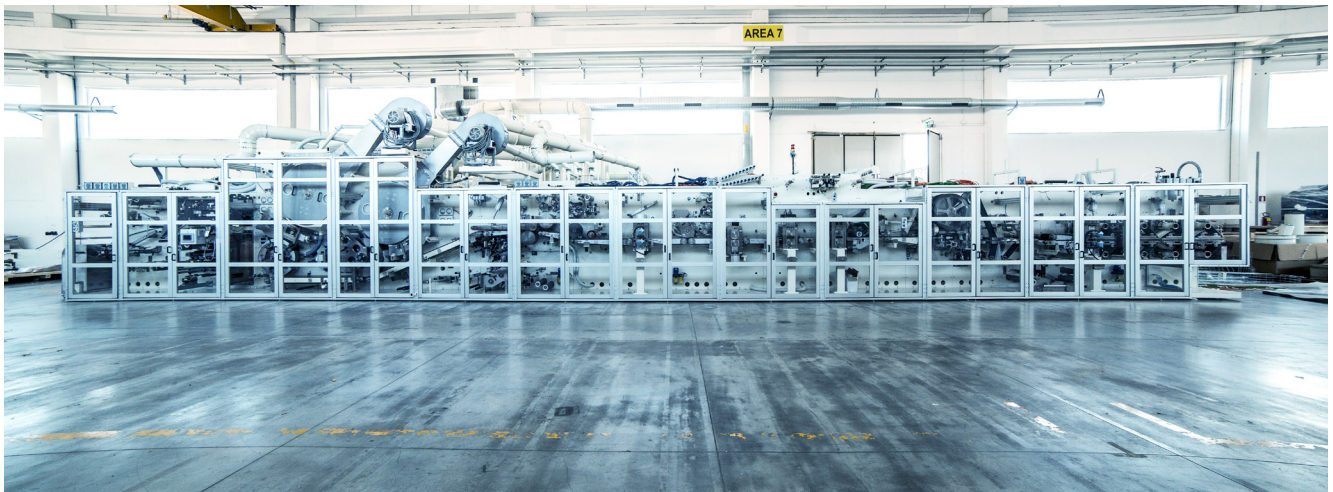
Service for hygiene converting

Our technical teams are based at our production sites and stay up-to-date with the latest technical evolutions. We also have technician teams located in various regions to bring their service expertise closer to your facilities. We always ensure that their skills are aligned with the specific scope of work.