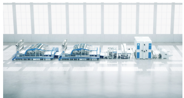
Service for spunlace