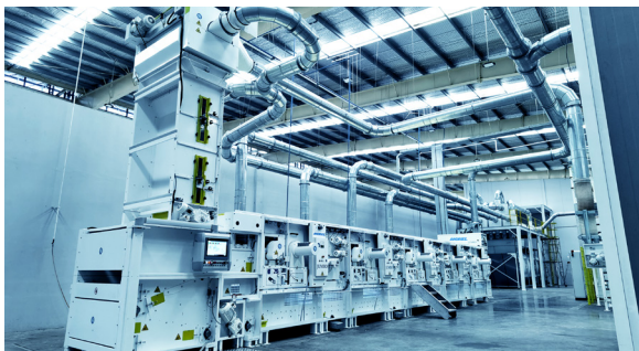
Service for mechanical recycling and airway