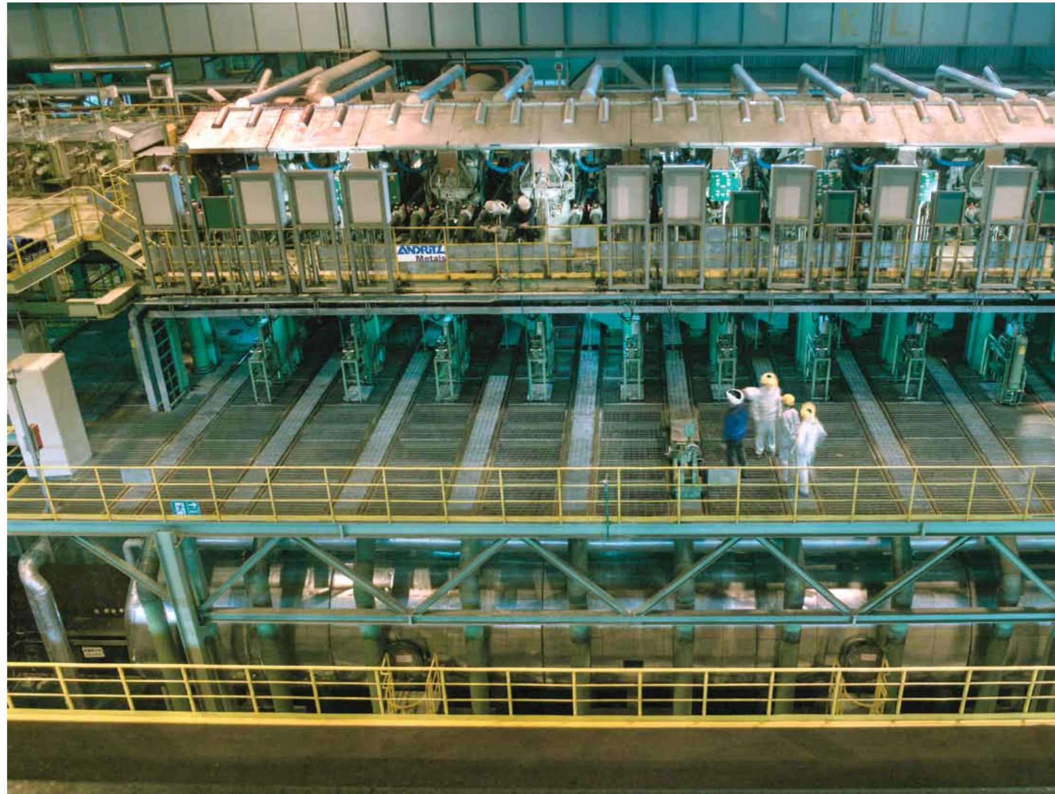
► Galvanizing plant