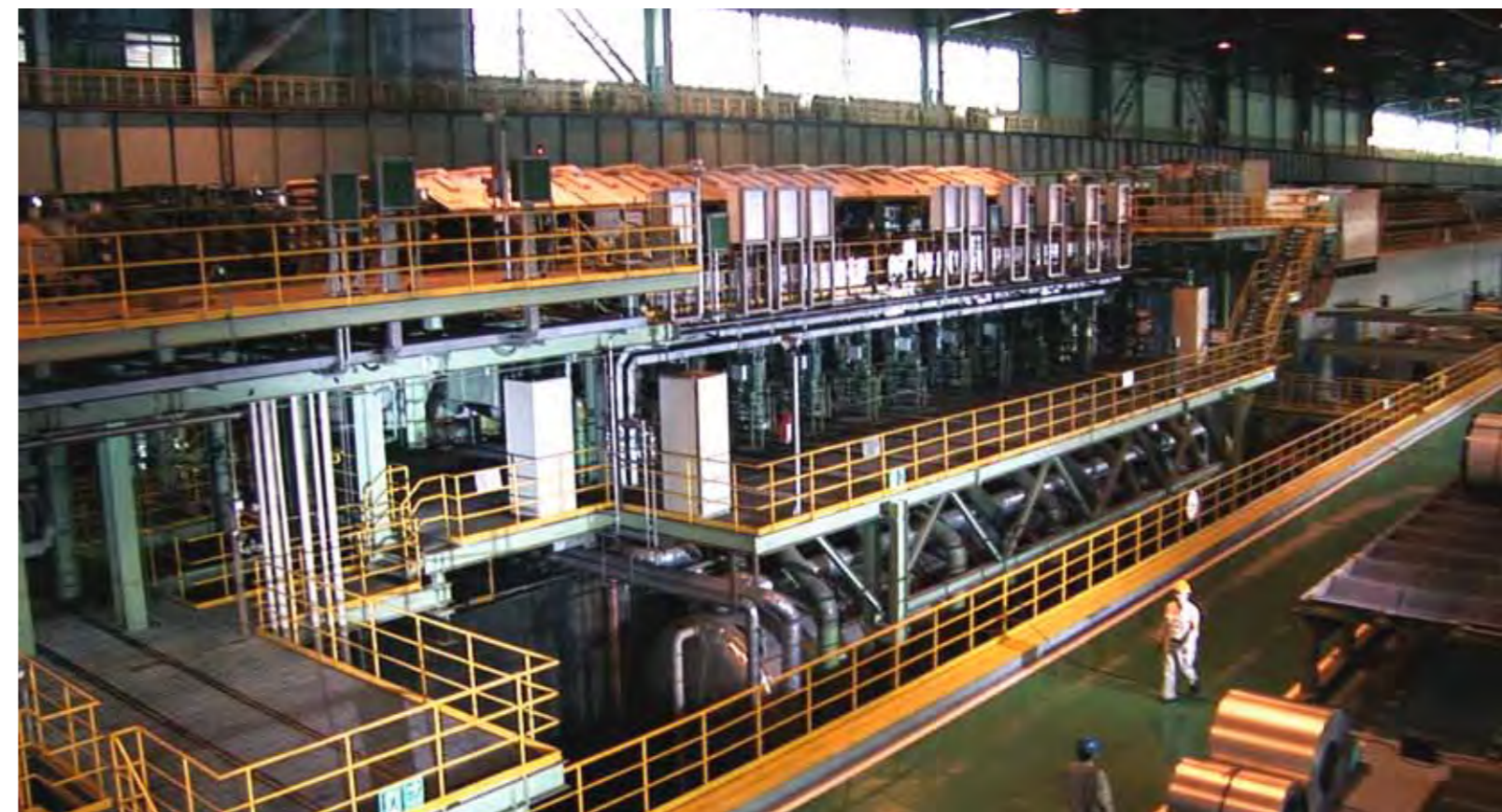
► Galvanizing plant