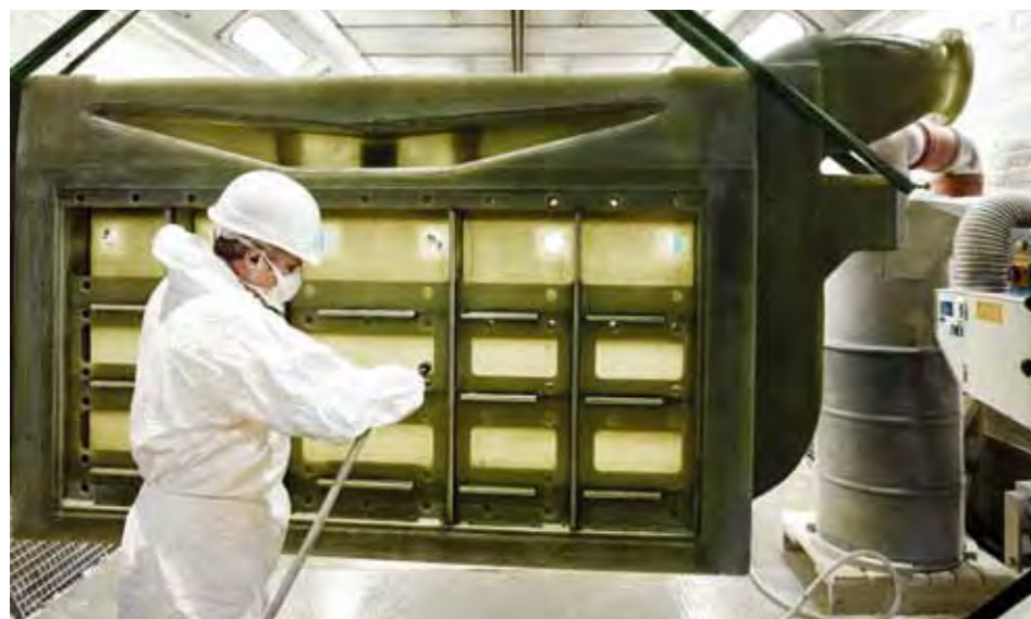
▼ GRAVITEL anode box