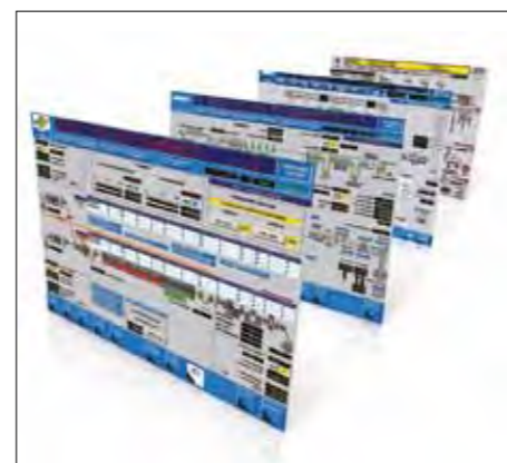
▲ Process visualization