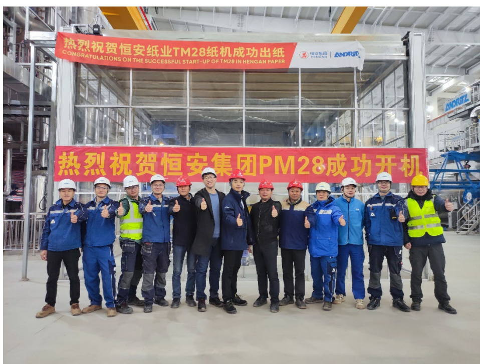
Successful start-up of TM28 PrimeLineCOMPACT M 1600 at Hengan Paper