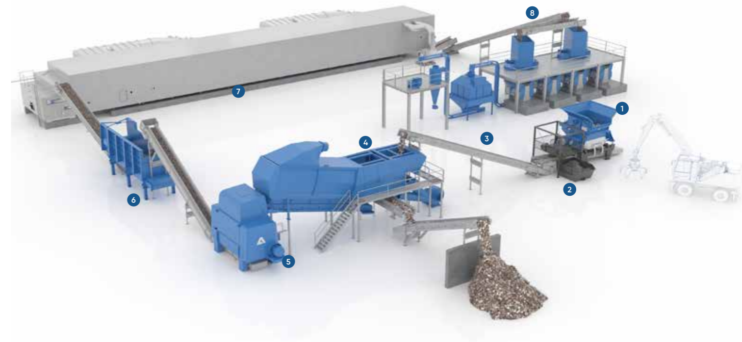
1 ADuro P shredder 2 ReMet BE 3 Conveyors 4 ReLift 5 ADuro S shredder 6 Bunker 7 Dryer 8 Pelleting Stage