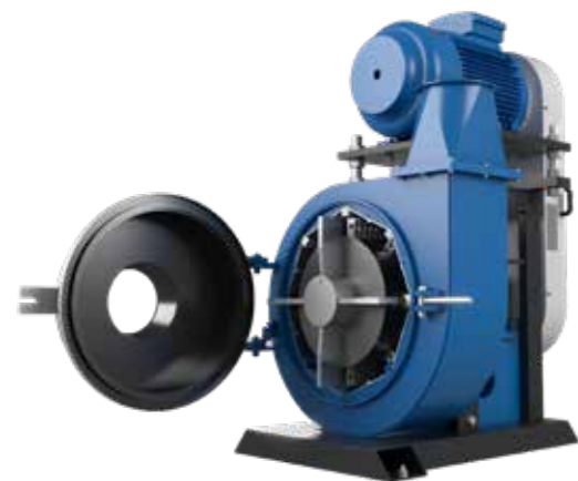
ADuro F with integrated fan

* for RDF: screen size 10 mm, density 150 kg/m 3 , pre-shredded to <50 mm