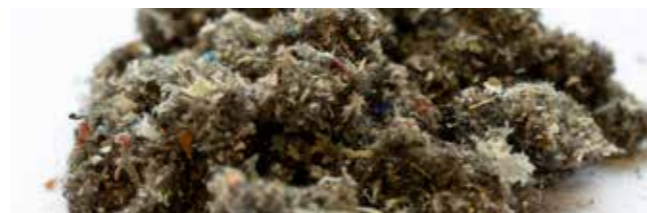
Pre-shredded material before and after grinding with ADuro F