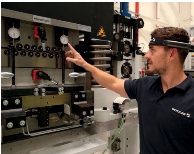
The user can send the view from his smart glasses via image or video transfer to the Schuler experts.