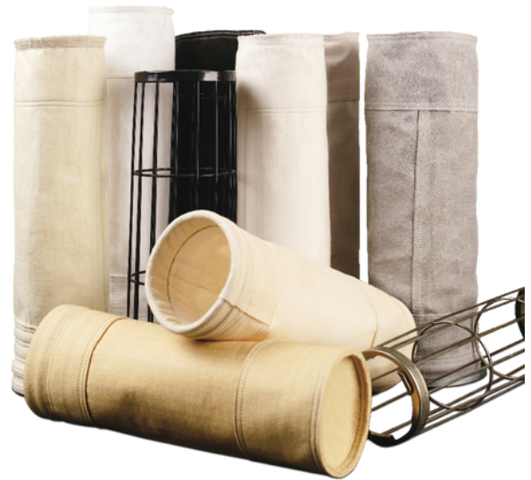
Bags and Cages.

ANDRITZ fabric filters have been developed over the past few decades to reduce particulate emissions, capital cost, and footprint.