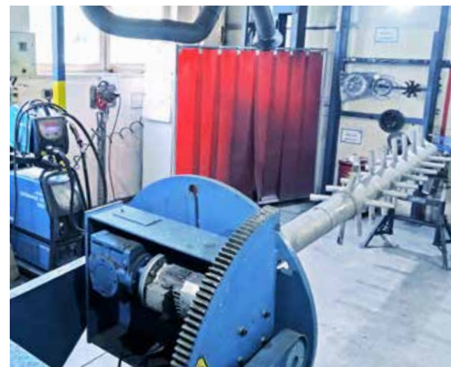
Pulper rotor repair of all kinds in the Levice service center

This includes dedicated machines and procedures as well as specialized personnel for this kind of equipment.