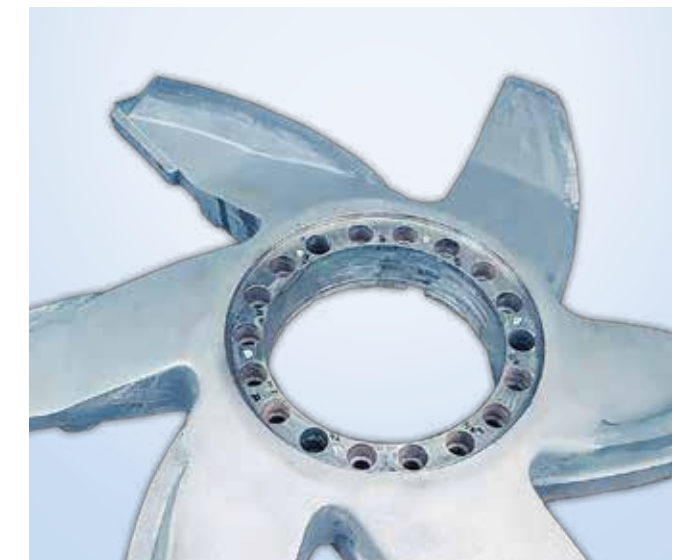
Rotors before and after repair

When needed, we offer customized and innovative repairs utilizing our latest product/process developments for improved service life. ANDRITZ is a process and technological partner for the customer and not just a supplier of parts. We will be happy to take up your challenges!