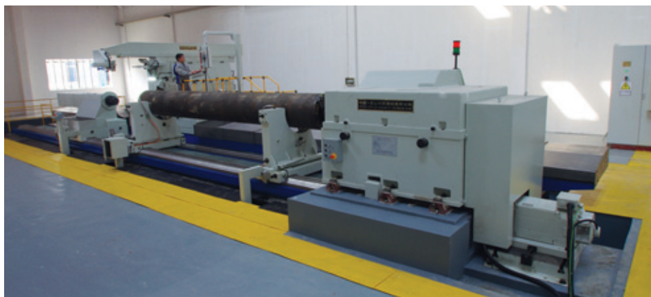
▲ Grinding shop in Wuxi

Our Wuxi technical center welcomes customers and offers an exclusive service to conduct trials with our aXcess range of technology specially developed for the Asian market. The 2.5 m wide pilot line is configured with our aXcess card, crosslapper, and a preneedler to demonstrate the machine capability at full speed.