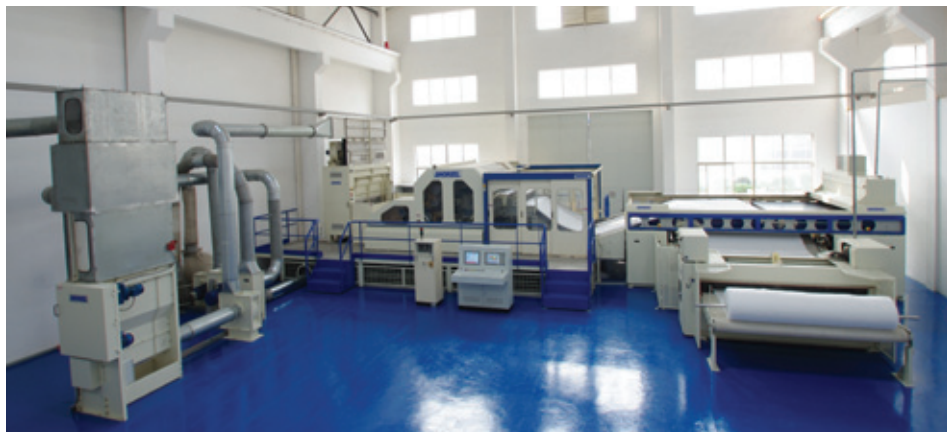
▲ Technical center with neXline needlepunch

service needs. Evaluation of new process settings and definition of parameters for product guarantees are additional opportunities we offer at our new facility in Wuxi.