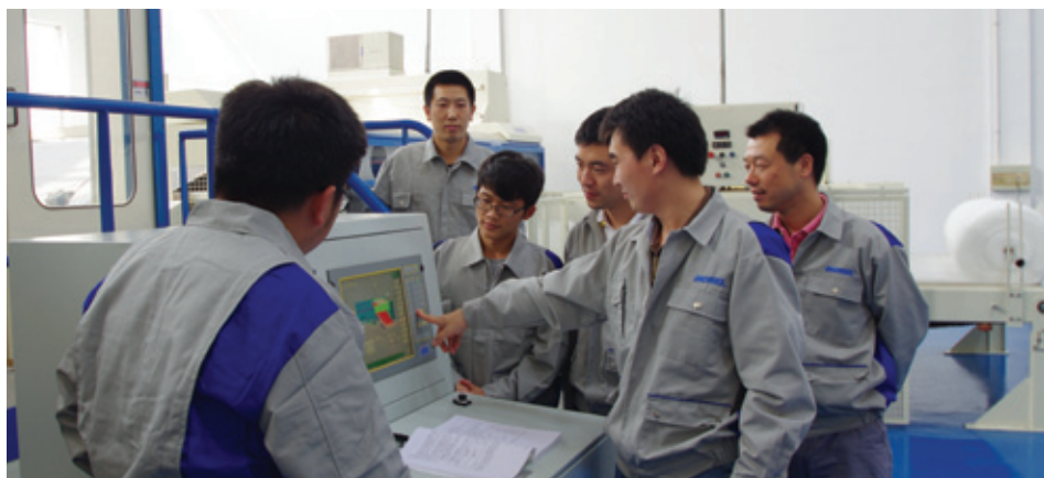
▲ Skill enhancement workshops and training courses

Our roll service center is equipped with grinding equipment as well as a test stand to provide prompt and high-quality service to our customers. All roll types can be repaired, reconditioned, and upgraded. With state-of-the-art machine tools and experienced technicians at your disposal, we offer a variety of options to suit your particular needs.