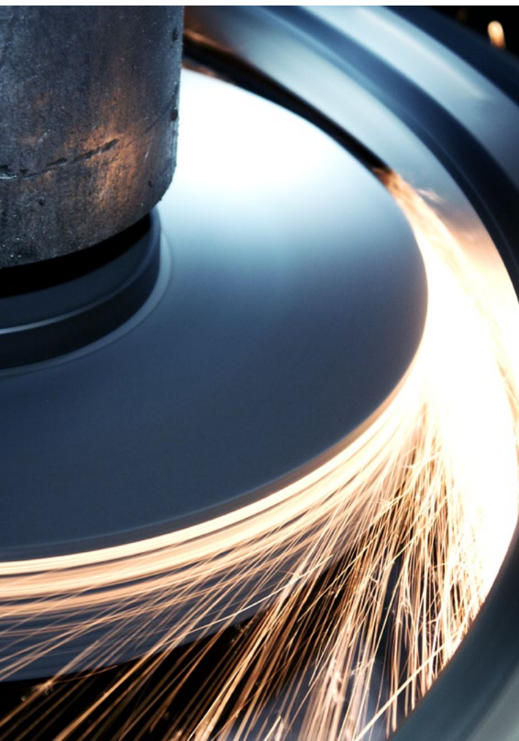
SVP pellet mill

Maintenance operations on the SVP and SVPC are safer, faster, and more flexible thanks to the separate system for adjusting rollers, dies that are assembled by either screw or clamp, and safety features such as a pneumatic quick-dump bypass, overload device and die hoist.