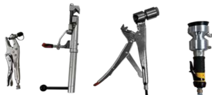
From left to right: Piercing plier for refrigerators, high-pressure piercing plier, NH 3 piercing plier, drill-head

Our fully automated solutions ensure environmentally friendly processing of refrigerants – from degassing to material separation – meeting the highest safety and efficiency standards.