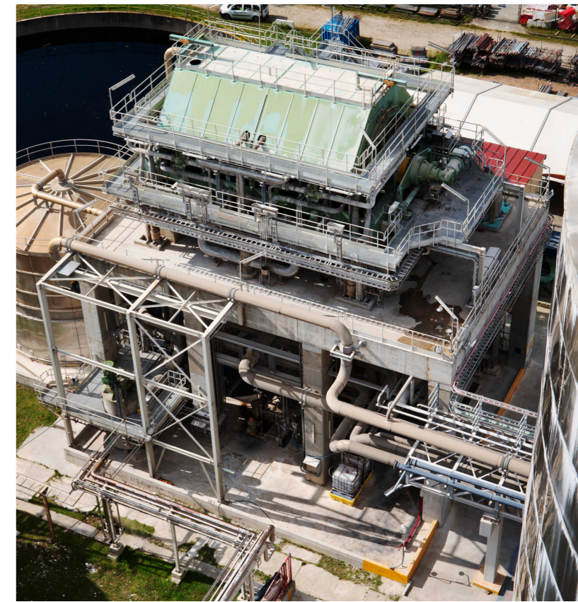
The improvements in brownstock washing came from the relocation of the wash press and replacing six filter washers with just one three-stage DD-Washer.