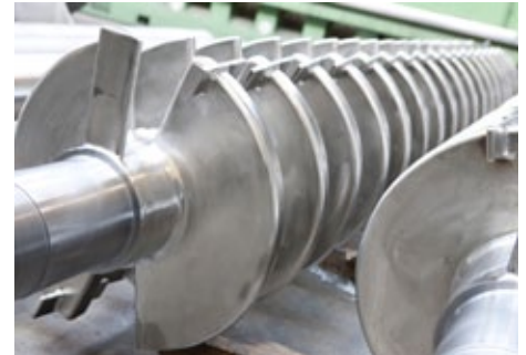
Details of a paddle dryer ▶